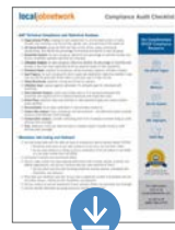
Compliance Audit Checklist