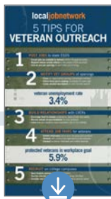
5 Tips for Veteran Outreach