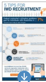
Tips for IWD Recruitment